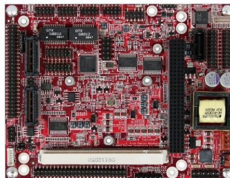
COM Express form-factor baseboard

In addition to these features, the COM Express form-factor baseboard adds four serial ports, RS-232/422/485 buffering, an AC'97 audio CODEC, digital I/O, a second gigabit Ethernet LAN interface, and flexible via stackable PCI-104 or SUMIT expansion and an on-board FeaturePak module socket.