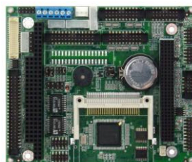
ETX form-factor baseboard

In addition to the ETX-945 COMs themselves, Diamond offers pre-integrated development kits based on generic or application-oriented ETX baseboards. The baseboards provide I/O connectors for quick and easy access to nearly all system interfaces, plus additional serial and digital I/O ports, a second Ethernet interface, a CompactFlash socket, and modular PC/104-Plus expansion. They also come with SO-DIMM memory, an extensive set of interface cables, and full documentation and software. The EPIC form-factor Neptune baseboard also adds an industry-leading data acquisition interface.