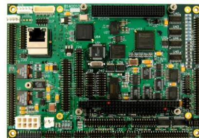
EPIC form-factor baseboard