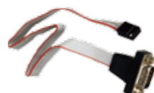
2x4p 2.54 mm to DB9 cable