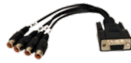
DB9 to RCA jack audio cable