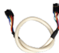
2x4p 2.54 mm cable