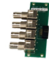
Video input daughter board With 4 x BNC connectors