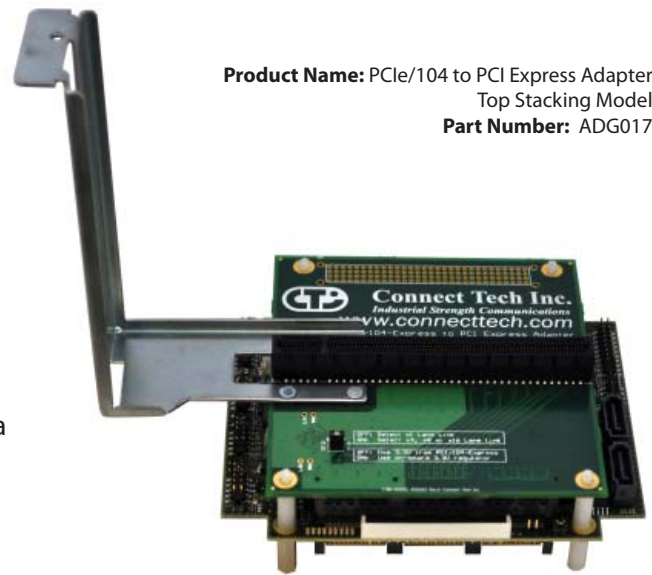
Product Name: PCIe/104 to PCI Express Adapter Top Stacking Model Part Number: ADG017